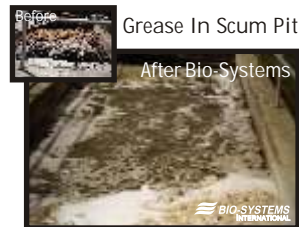
Grease in a Scum Pit:

Six foot deep grease accumulation eliminated in thirty days!